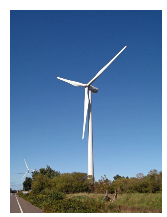
Ishikari Community Wind Power Plant Service commended in January 2008