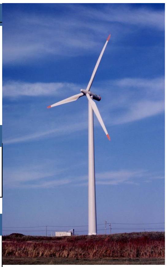
Japan's first community investment-type wind power plant (Hamakaze-chan in Hamatonbetsu-cho, Hokkaido)