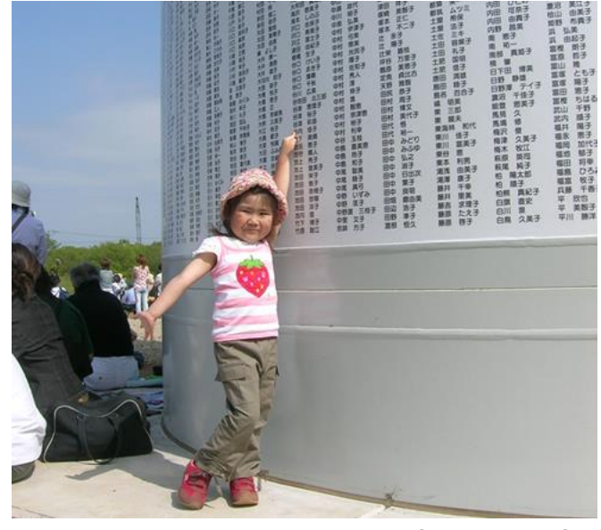
Isn't my wind turbine fantastic?